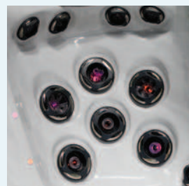
StressRelief™ Neck and Shoulder Seat with Afterglow Lighting